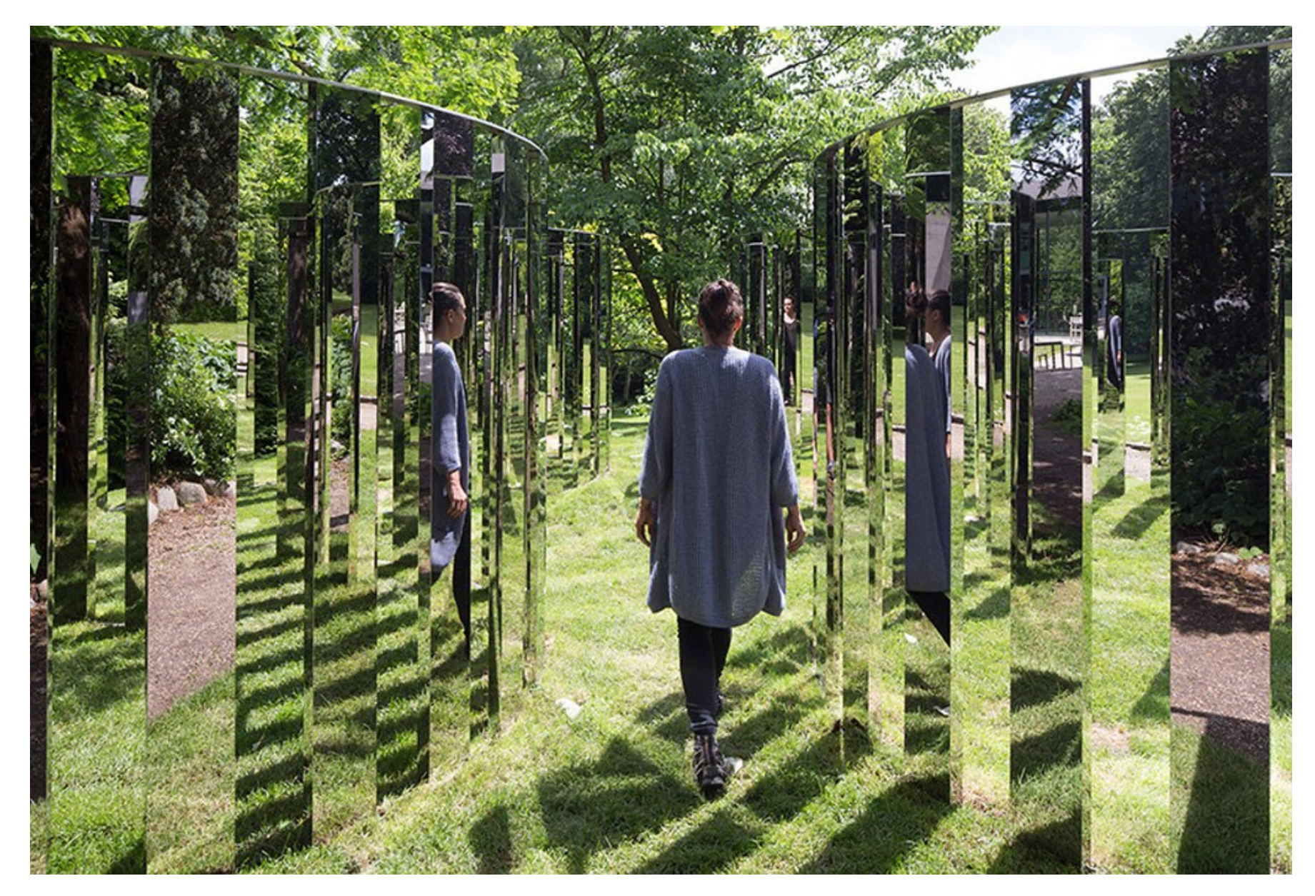
"Cloud Gate" By Anish Kapoor