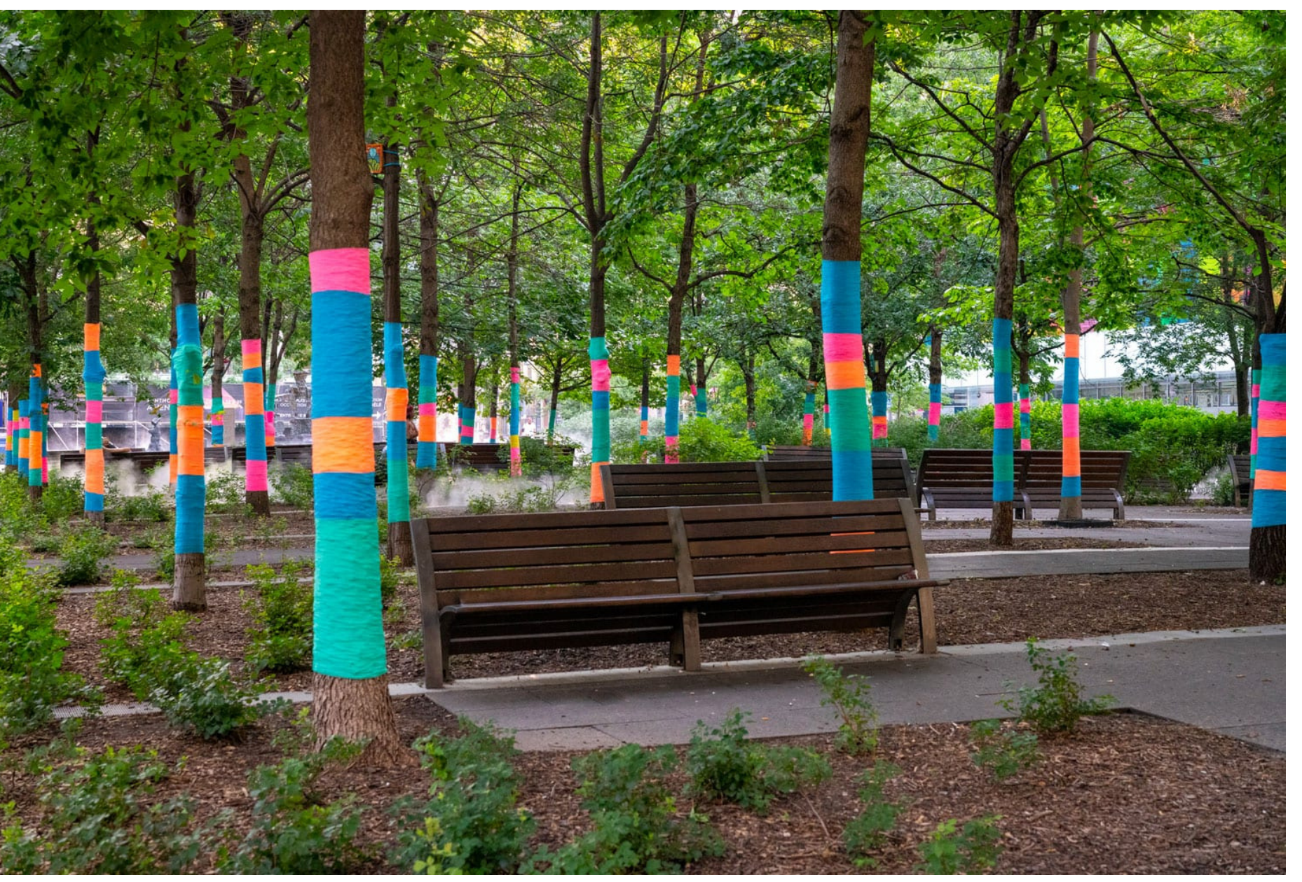
"Ça va bien aller!" By Judith Portier